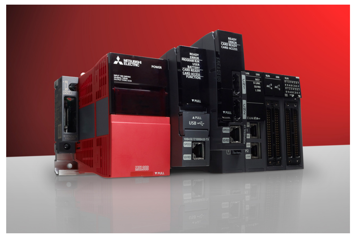
Industrial systems need true determinism.

The Institute of Electrical and Electronics Engineers (IEEE) has set up a Time Sensitive Networking (TSN) task group<sup>2</sup> to create an industry standard on this issue.