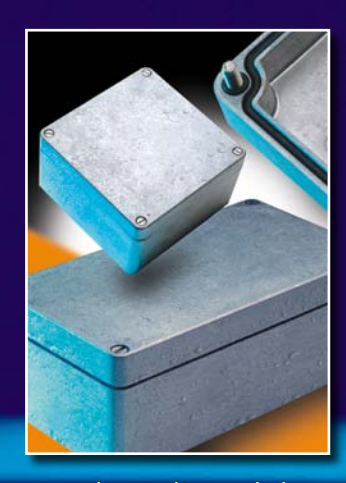
1590Z heavy duty sealed