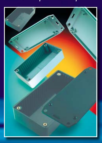
1591 general purpose ABS