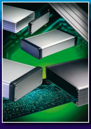
1455 extended range