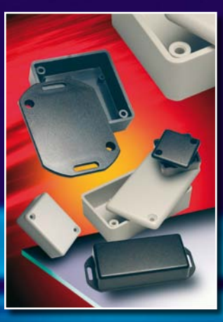
1551 miniature general purpose