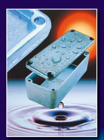
1590 die-cast aluminium