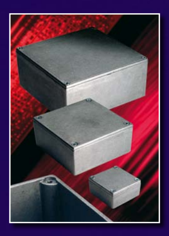
Eddystone die-cast aluminium