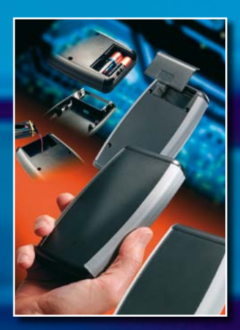
1553 soft sided