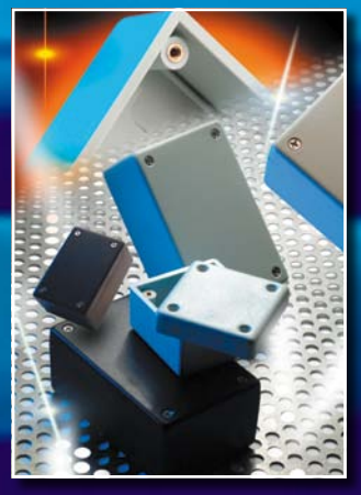
1594 heavy duty